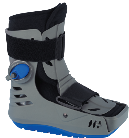
XLR8 Full Mid Calf Shell Walker