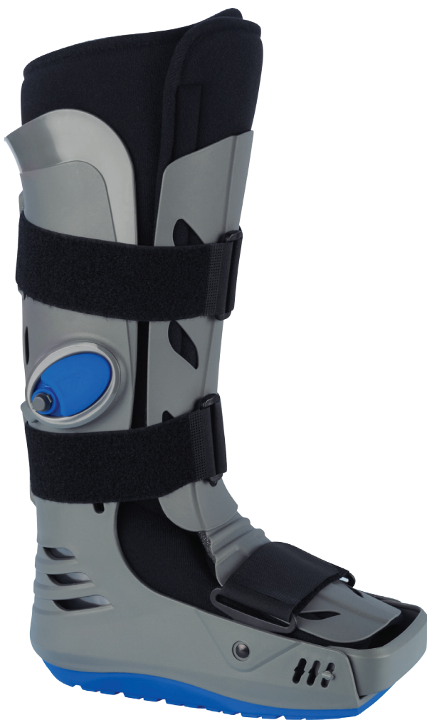
XLR8 Full Shell Walker